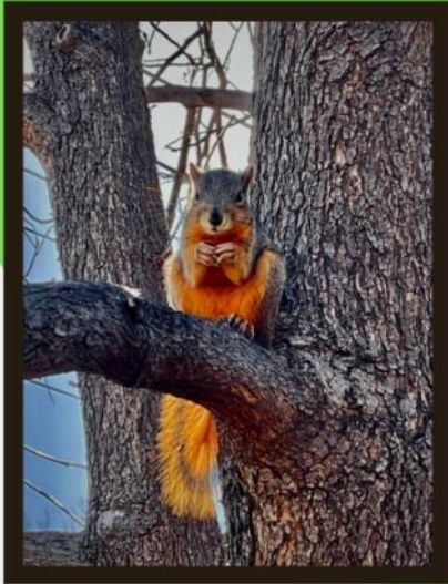
Wildlife McKinley Clark