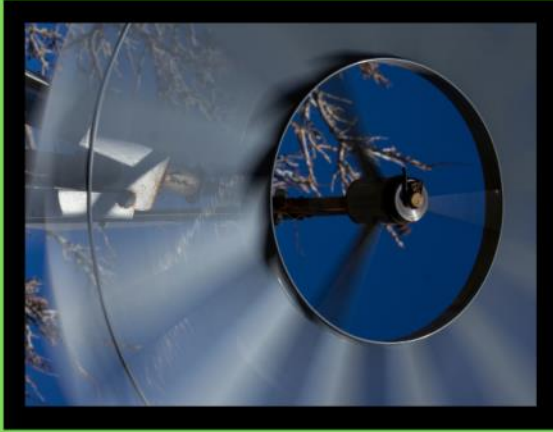
Motion Raylee Knox