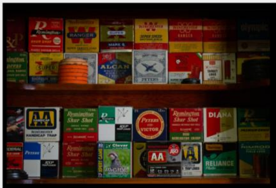
Something Beginning with "A" Raylee Knox