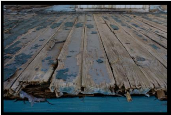
Lines Raylee Knox