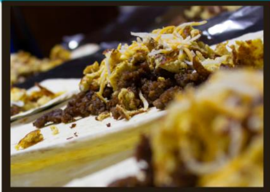
Unusual Perspective Raylee Knox