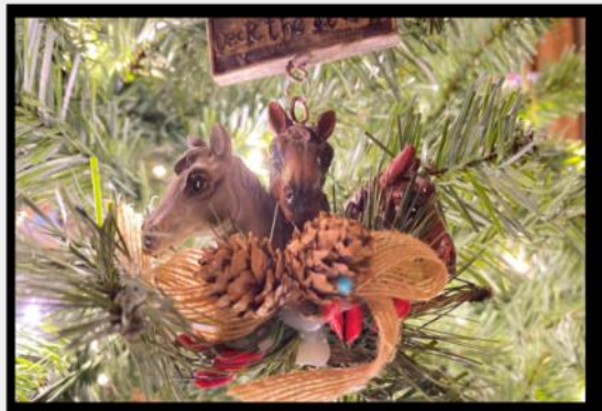
Christmas Angelique Ritchie