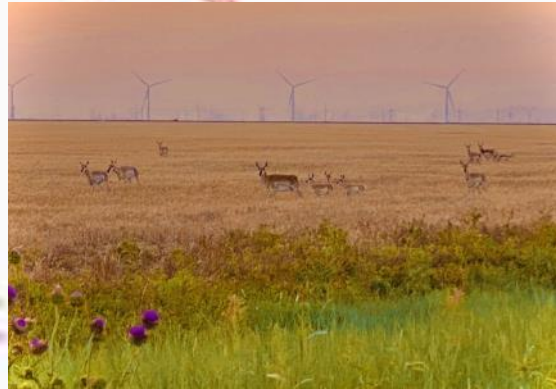
McKinley Clark - Animals Wildlife