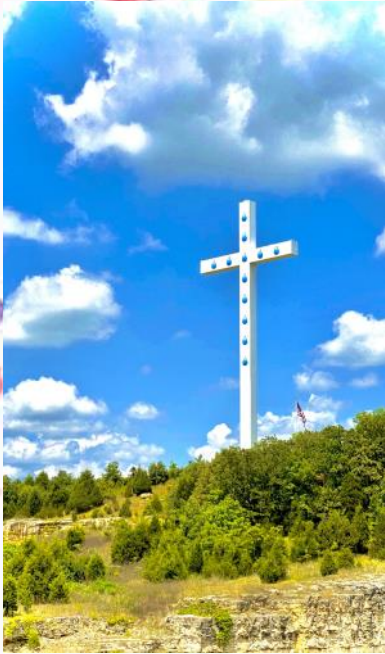
McKinley Clark - Landscape/ Nature

Good luck to Flannery May and McKinley Clark for the entering photos in the District 1 4-H Photography contest. The results should be in the first week of August!