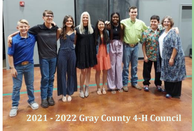
2021 - 2022 Gray County 4-H Council