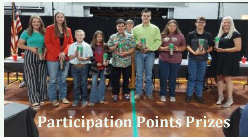
Participation Points Prizes