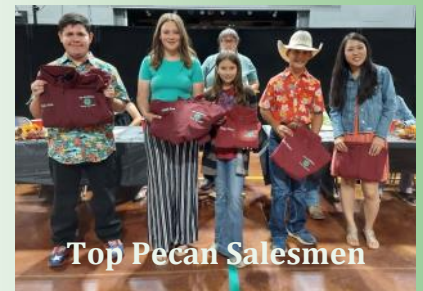
Top Pecan Salesmen

This year's 4-H Banquet was a great success with many awards handed out. It was great seeing everyone who could make it and participate in the recognition event. We are sorry to have missed those of you who were unable to attend. The following are some of the awards recipients: