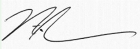
County Extension Agent