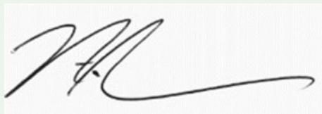
County Extension Agent

Gray County Extension Office 12125 E. Frederic Ave., St. C Pampa, Texas 79065 806-669-8033 806-669-8029—Fax email—gray@ag.tamu.edu