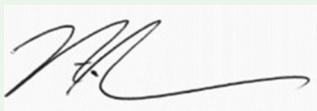
County Extension Agent