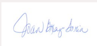
County Extension Agent Family & Community Health

Gray County Extension Office 12125 E. Frederic Ave., St. C Pampa, Texas 79065 806-669-8033 806-669-8029—Fax email-gray@ag.tamu.edu